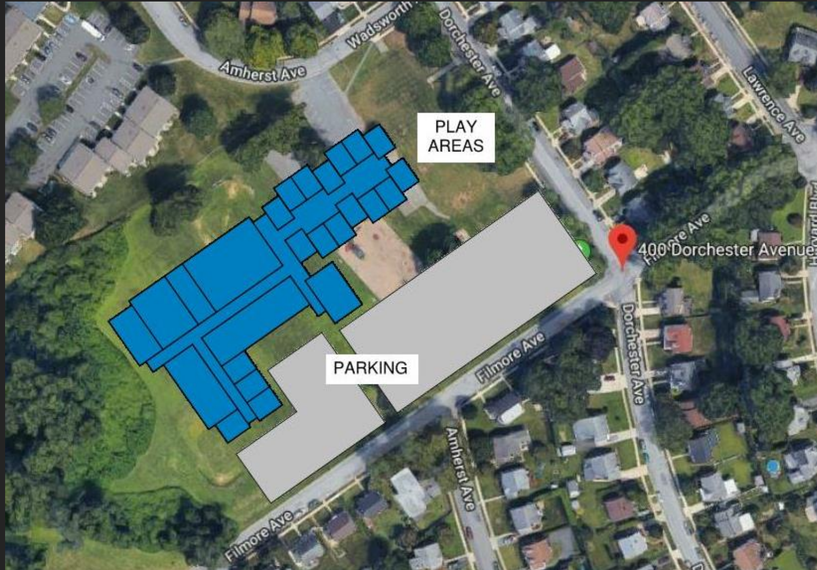
Existing District owned land