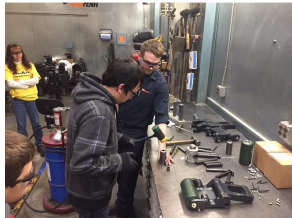
Repairing & replacing a bushing for a piece of material handling equipment.