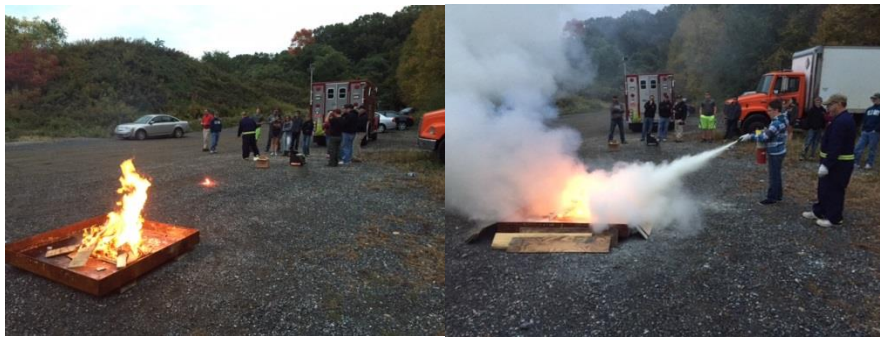
Fire safety training and explanation of the different type of extinguishers.