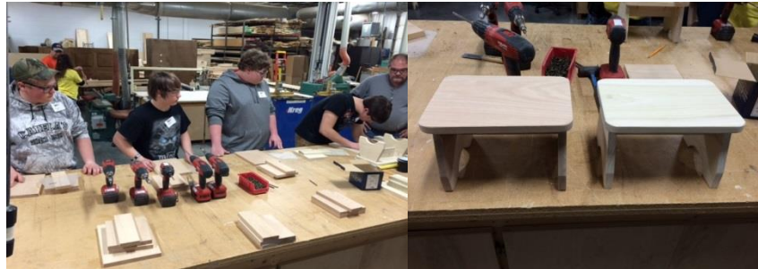
Explorer Post member building a bench in the furniture/wood shop at East Penn Mfg.